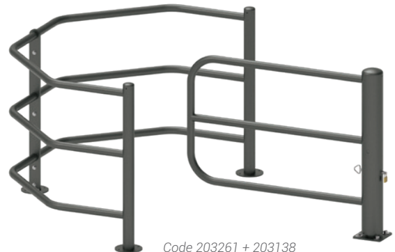
Code 203261 + 203138