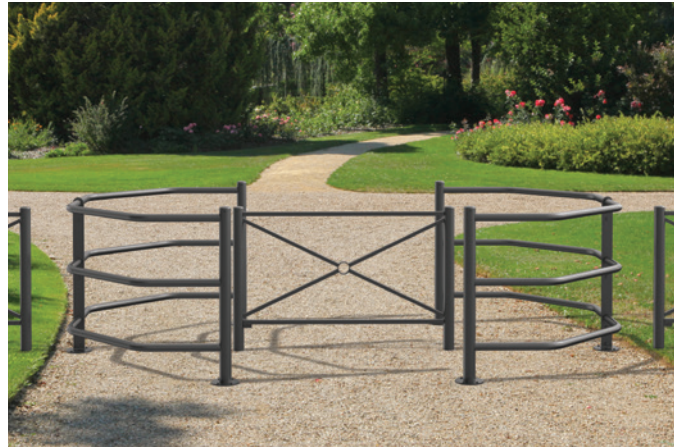
Code 2 x 203261 + 206081